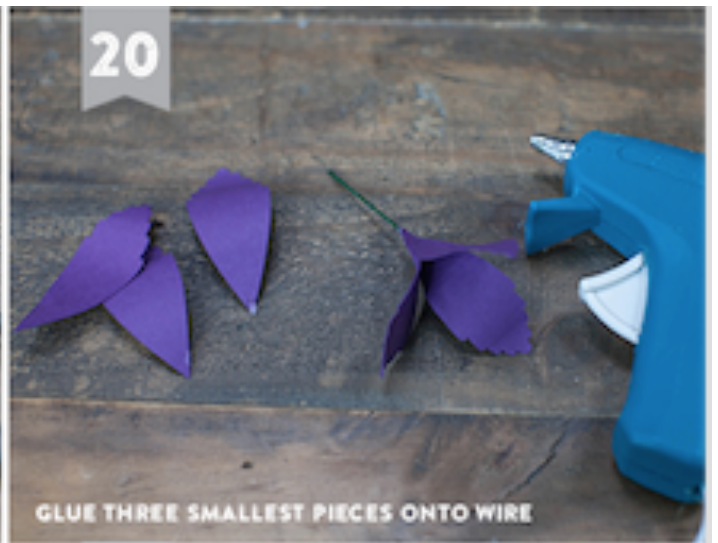
20 GLUE THREE SMALLEST PIECES ONTO WIRE