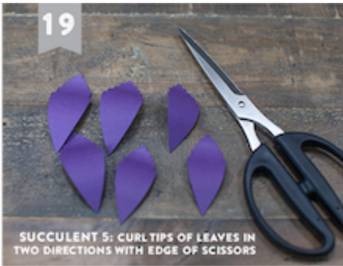
19 SUCCULENT 5: CURL TIPS OF LEAVES IN TWO DIRECTIONS WITH EDGE OF SCISSORS