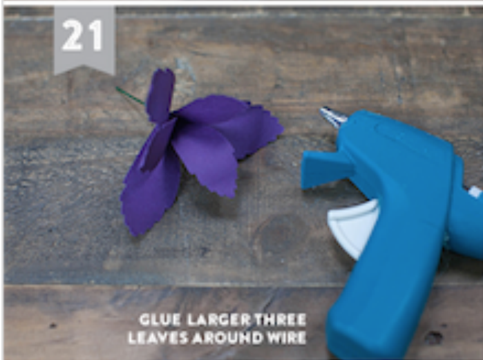
21 GLUE LARGER THREE LEAVES AROUND WIRE